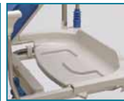
Integrated Utility Tray