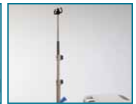
Integrated 3 Stage IV Pole

Hill-Rom reserves the right to make changes without notice in design, specifications and models. The only warranty Hill-Rom makes is the express written warranty extended on the sale or rental of its products.