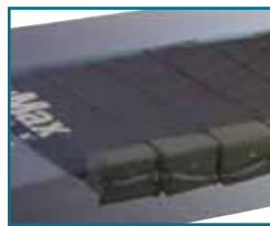
AccuMax Quantum™ VPC Mattress