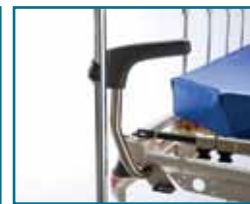
Grey push handles with IV Pole Transport Device