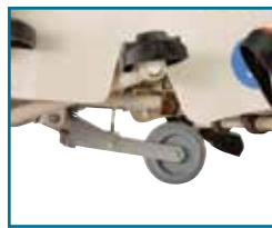
Next Generation Plus Steering™ system provides crisp cornering and control