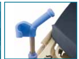
Blue ergonomic push handles with IV Pole Transport Device