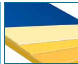
Tempur-Pedic® Medical Mattress